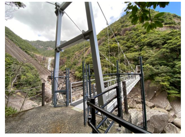
(View of the suspension bridge, the end of the path)